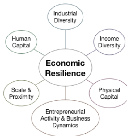
Figure 1: Proposed Framework for County Economic Resilience Index (CERI)

The County Economic Resilience Index (CERI) builds on past research and analysis that used economic resilience indicators as one dimension in community resilience and/or social vulnerability index (Cutter et al., 2003, 2008, 2009; Peacock, 2009; EDAW and AECOM, 2009). The approach is based on the assumption that economic resilience is a complex phenomenon which cannot be explained by one single attribute but multiple attributes of a region can be combined to create a single, composite index value. Figure 1 and Table 1 shows the proposed framework. The County Economic Resilience Index (CERI) proposed in this study has six dimensions: industrial diversity, entrepreneurial activity and business dynamics, human and social capital, scale and proximity, and physical capital (infrastructure).